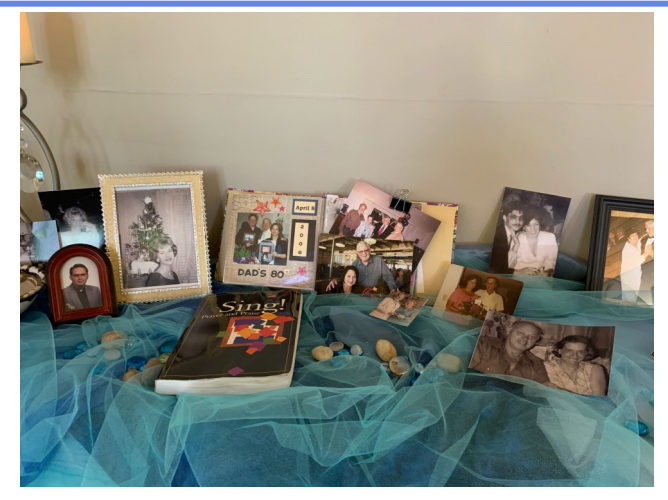
Pouring Out our Grief