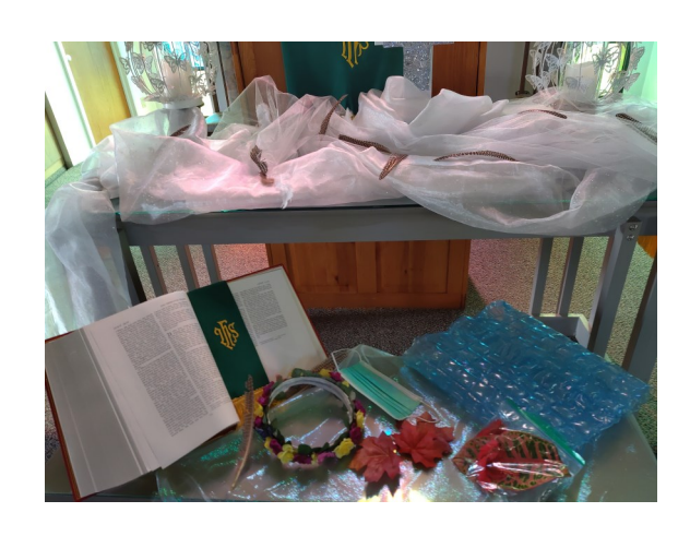
Air—That which sustains us