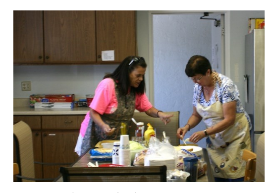
Our chefs grilled hotdogs, hamburgers, and veggie burgers, and our sous chefs took orders and prepared the plates.