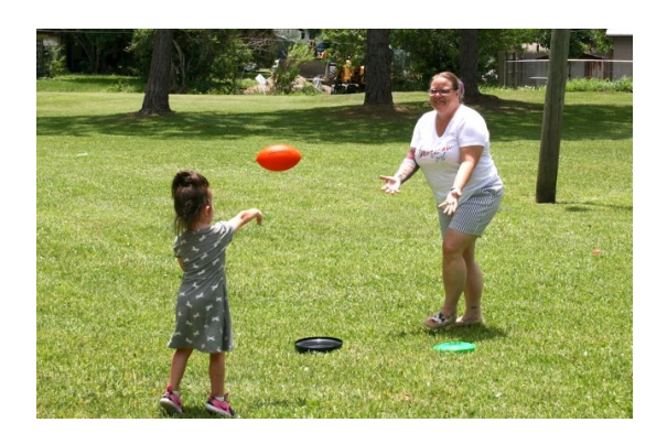
People of Hope enjoyed food, fellowship, and fun on a beautiful Saturday afternoon.